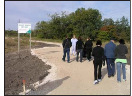
ST. MARY'S TO GLENMEADOW