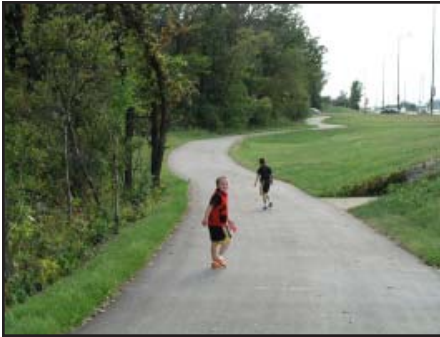
SEINE RIVER TO ST. ANNE'S ROAD