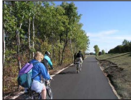
SEINE RIVER TO SHOREHILL DRIVE