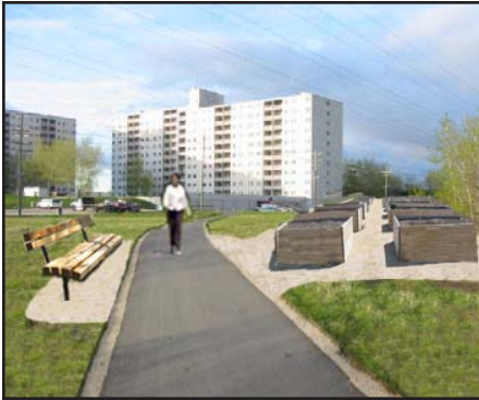
Conceptual image of community garden

Construction of the community gardens is underway!